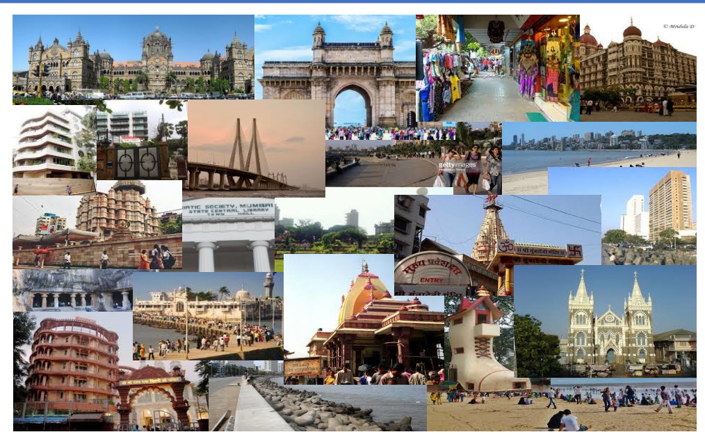
Picture1: Various Spots of Mumbai

An International, Open Access, Peer Reviewed, Refereed, E- Journal in English